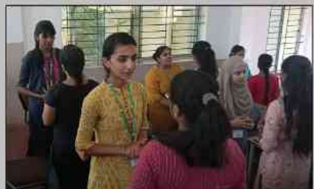
Providing training for the first year students about their self-introduction for their future on 18.04.2023.