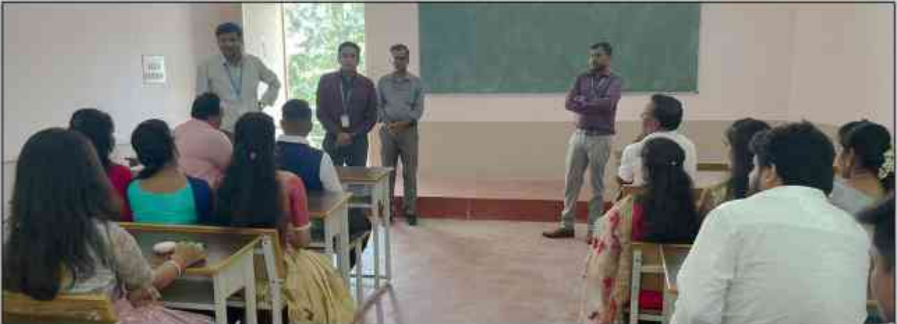
The Parents teachers meeting conducted on 25 July 2023 at MBA Department to discuss about curricular & academic matters.