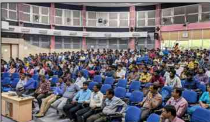
Faculty members and students presented in the 2022-2023 batch orientations program.