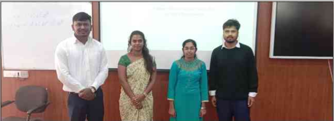
The Alumni & Teachers meeting conducted on 22 July 2022 at MBA Department to discuss about Placement and Entrepreneurship activities.