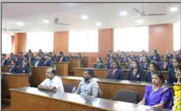
Faculty members, Class representatives and Final year students were presented on the occasion of ADAMYA – 2022.