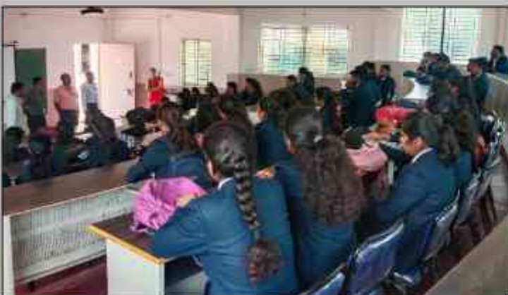
Teachers and Final year students meeting conducted on 25 July 2023 at MBA Department to discuss about curricular and academic matters.